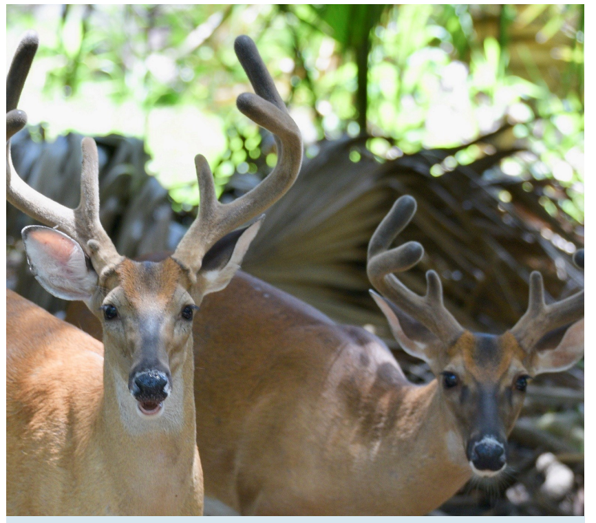
Edisto Deer