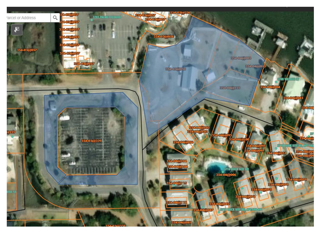
Burley L. Lyons Park:

Bay Creek Park and adjacent parking area (McConkey Square):