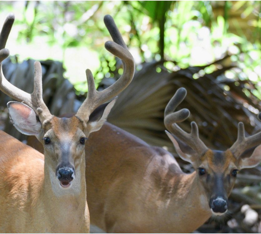
Edisto Deer