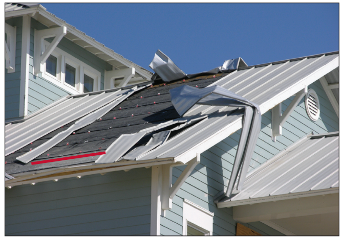
Figure 1. This architectural panel system has concealed clips. The panels unlatched from the clips. The first row of clips (just above the red line) was several inches from the end of the panels. The first row of clips should have been closer to the eave.