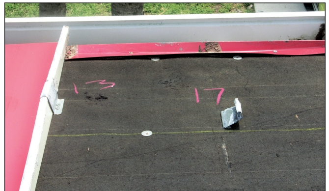
Figure 4. These eave clips were too far from the panel ends. The clip at the left was 13" from the edge of the deck. The other clip was 17" from the edge. It would have been prudent to install double clips along the eave.