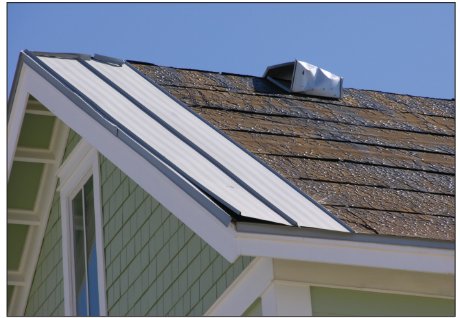
Figure 3. These architectural panel system have snap-lock seams. One side of the seam is attached with a concealed fastener. Although a large number of panels blew away, the underlayment did not.