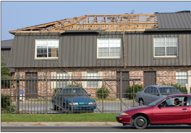
Figure 6. Blow-off of nailers caused these panels to progressively fail. The nailers were installed directly over the trusses. In an assembly such as this where there is no decking, there is no opportunity to incorporate an underlayment. With loss of the panels, rainwater was free to enter the building.