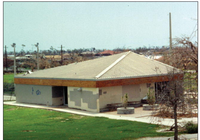
Figure 2. This structural standing seam roof system survived Hurricane Andrew (Florida, 1992), but some hip flashings were blown off. The estimated wind speed was 170 mph (peak gust, Exposure C at 33 feet).

For observations of metal roofing performance during Hurricanes Charley (2004, Florida), Ivan (2004, Alabama and Florida), and Katrina (Alabama, Louisiana, and Mississippi, 2005), respectively; see Chapter 5 in FEMA MAT reports 488, 489, and 549, available on-line at: