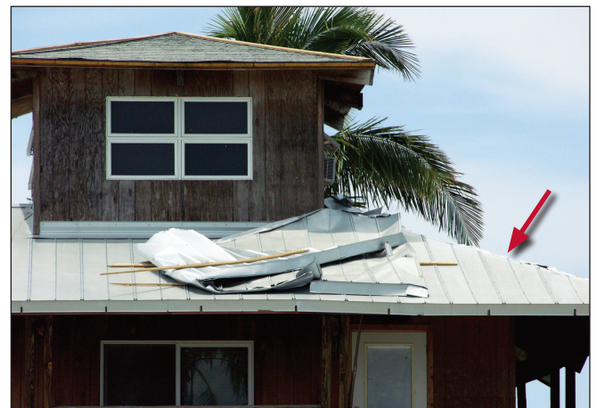
Figure 5. The panels blew off the upper roof and landed on the lower roof of this house. The upper asphalt shingle roof shown had been re-covered with 5V-Crimp panels that were screwed to nailers. The failure was caused by inadequate attachment of the nailers (which had widely-spaced nails) to the sheathing. Note that the hip flashing on the lower roof blew off.