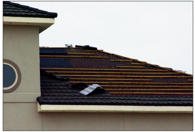
Figure 7. This residence had metal shingles that simulated the appearance of tile. The shingles typically blew off the battens, but some of the battens were also blown away.